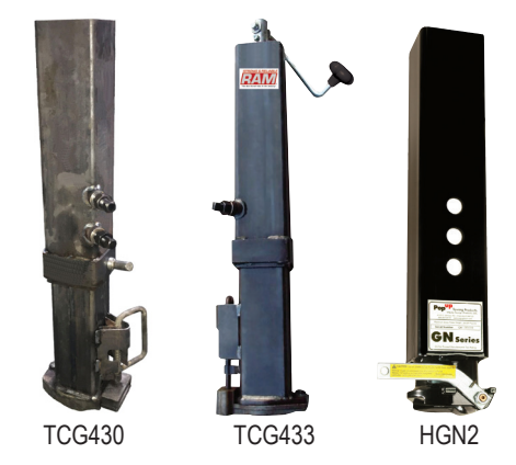
•25/16" ball, 32" retracted height