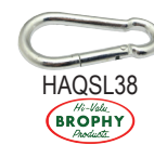
HAQSL38 No-Idly BROPHY Products