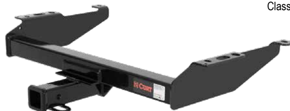
13042 Class 3