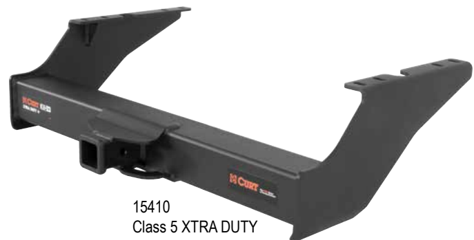
15410 Class 5 XTRA DUTY