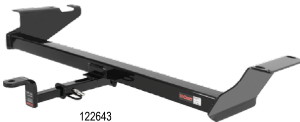
122643 Class 2