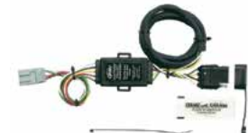
Power Converter Wiring Kit